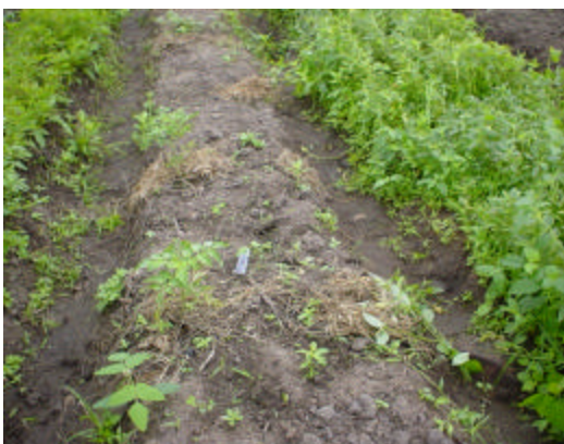
Fig. 1. Stubble mulching on a vegetable farm in Ogun State, South-Western Nigeria.

been, and are likely to be, used for maintaining cost-effective and environment-friendly crop yields. Figs. 2 and 3 show inter-cropping in Ogun State of South-Western Nigeria.