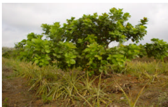
Fig. 4. Alley cropping of a tree crop with an arable crop in Ogun State, South-Western Nigeria.

These IK facts notwithstanding, it is becoming evident that they must be supplemented with modern technologies which have been demonstrated, in recent times, that they can be made environmentally acceptable in terms of food safety. One of such modern technologies, agro-chemicals , is the subject of the present study and report.