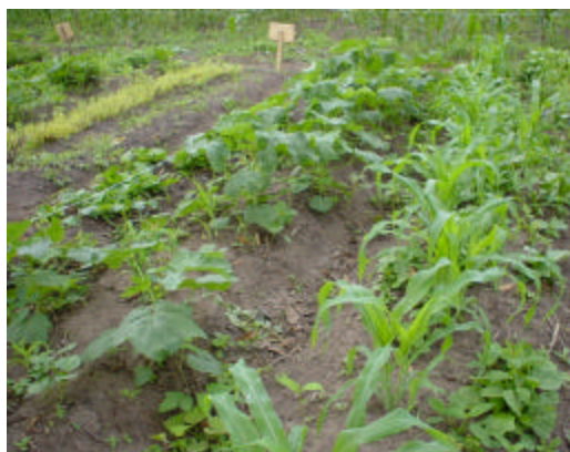
Fig. 2. Intercropping of cereal with a legume in a local farm of Ogun State, South-Western Nigeria