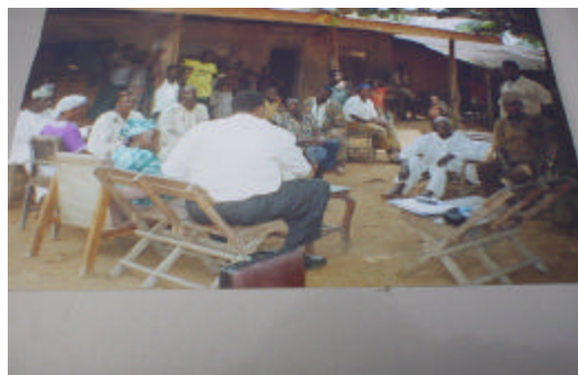
Fig. 6. Focus Group Discussions and Key Informant Interview Sessions in a typical farm homestead.

The study adopted the Rapid Rural Appraisal Method using questionnaires in a household survey format, using 100 farmers in each of the two locations. This was complemented with Focus Group Discussions with respondents involving recorded interaction with respondents under a semi-formal arrangement. The community leadership and some community based organizations representatives were also interviewed as Key Informants (Fig. 6), as detailed in Ayinde (2004). This was done because of the strong cultural values attached to traditional leadership through knowledge by oral history (Akinbode et al 1984) and the need to adopt new modus of extension services for upliftment of the quality of life in rural areas (Adedipe 1983). The Questionnaire used is attached hereto as an Appendix.