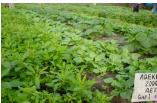
Fig. 3. Intercropping of a broad-leaf vegetable with short duration narrow-leaf vegetable experiment in Ogun State, South-Western Nigeria.